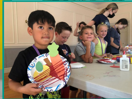
Pictures from top to bottom: the Communion Table set for Maundy Thursday; the chancel decorated for Christmas Eve; the 2022 Confirmation Class; members of the 2022 Mission Team serving in Coatesville, PA; the note attached to blessing bags put together at the 2022 OSU Day of Service; children making crafts at Vacation Bible Camp in August 2022.